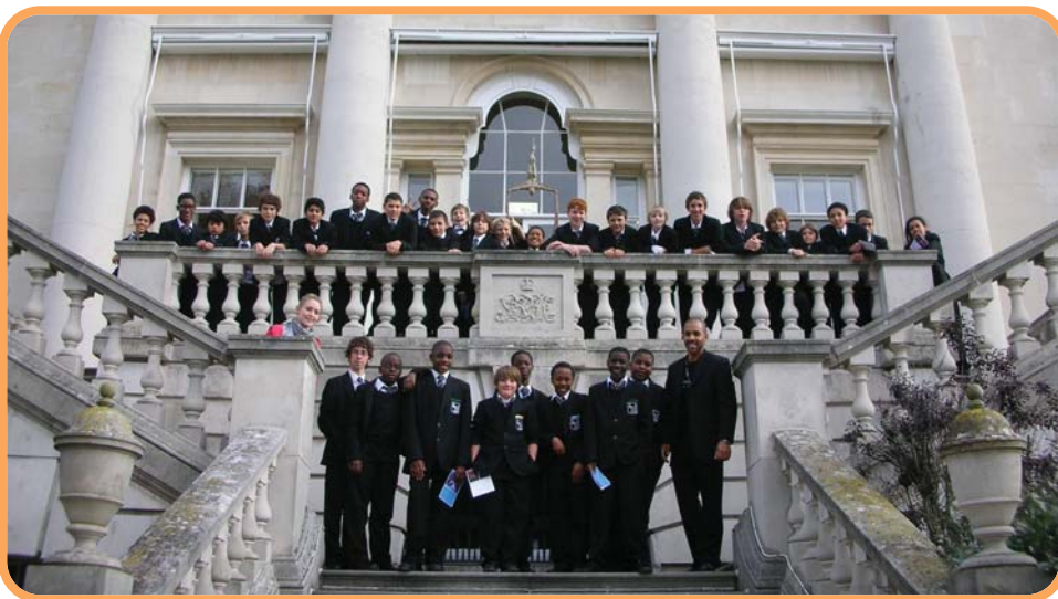
KS3 visit to the Royal Ballet School, November 2010